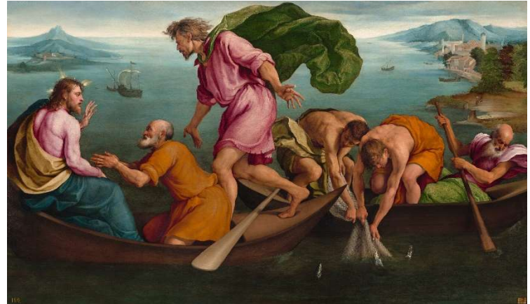
The Miraculous Draught of Fishes, 1545, Jacopo Bassano

The Letter to the Hebrews speaks of Jesus as the High Priest who has entered the highest heaven. Christ is indeed the true priest who has offered his life in sacrifice for the reconciliation of mankind with God. Yet Christ's resurrection and ascension have not separated him from us. The whole point of the incarnation is that our High Priest is one 'who has been tempted in every way that we are, though he is without sin.' It is because the Son of God became a human being in Jesus Christ that we can come to him as we are . We do not pretend to be any better than we truly are, but trust in his mercy and forgiveness.