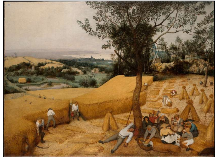
The Harvesters, Pieter Bruegel the Elder (1565)

The twelve apostles named in today's gospel had the supreme privilege of spending the three or so years of Jesus' public life with close companionship with him. What is recorded in the gospels is just a tiny fraction of all the apostles' experience with the Lord. Jesus chose them precisely so that they should be the first people to share their knowledge of the Lord, and to bring all peoples the healing and forgiveness of God. This remains the core mission of the Church. Through the ages, in the tradition of the apostles, the Church continues to proclaim the Good News and to bring to people to Jesus, the true shepherd of their souls.