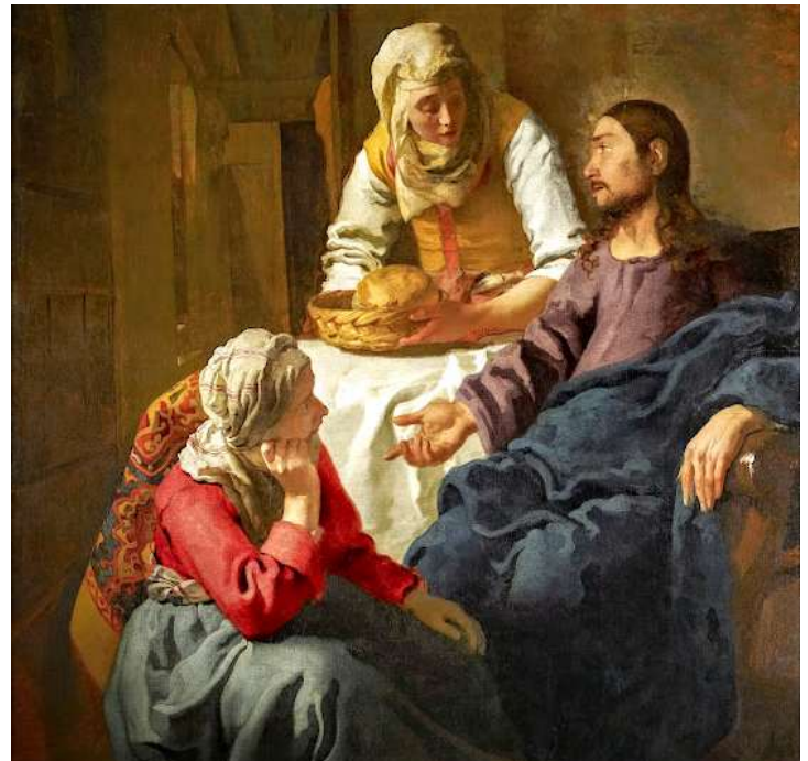
Christ in the House of Martha and Mary, Johannes Vermeer (1632-1675)