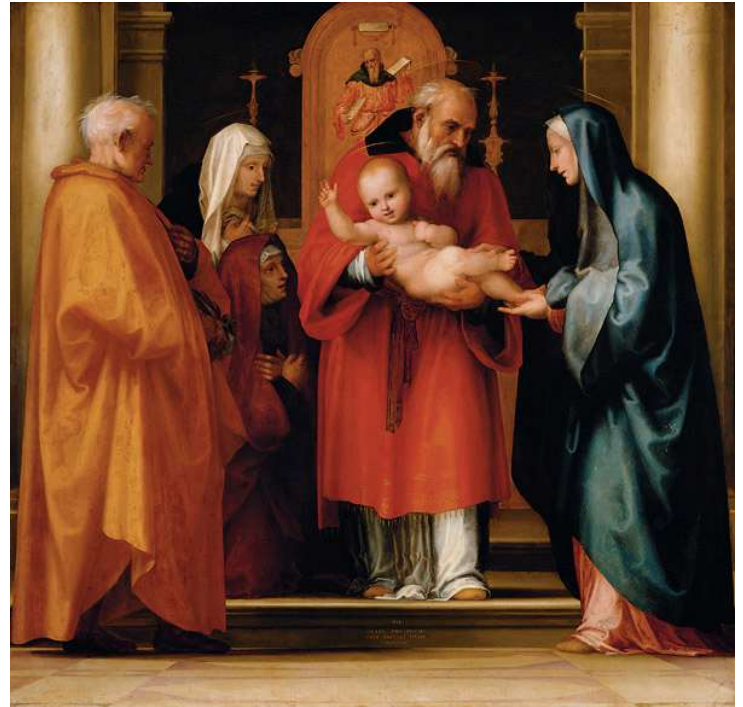
Presentation of Jesus at the Temple, Fra Bartolomeo (1472-1517)

The Feast of the Presentation of the Lord, or Candlemas, goes back at least to the fourth century. It has always been understood as the showing of Christ as the 'light of the nations'. St Luke expresses with extraordinary beauty that, through the witness of the aging Simeon and Anna, the Christ child is the fulfilment of the ancient prophecy of Malachi. It is Jesus whom the people of Israel seek, the Messiah who will suddenly enter his temple.