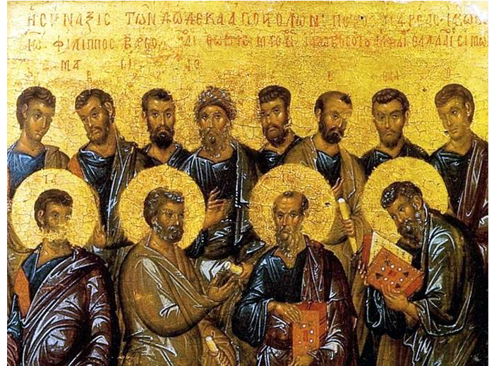
Synaxis of the Twelve Apostles by Constantinople master (early 14th c., Pushkin museum)

There is a message for every Christian in the simplicity underlying Jesus' commissioning of the Apostles in today's gospel. That message is that faith in Christ is essentially simple. It is all too easy for us to clutter up the gospel with our own baggage. When we do that we eclipse the simplicity that is at the heart of the gospel: love of God and love of neighbour.