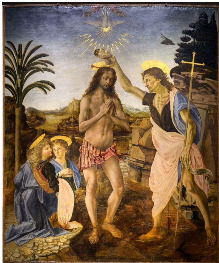
The Baptism of Christ, Andrea del Verrocchio and Leonardo da Vinci (1472-1475)

Jesus fulfils the prophecy of Isaiah. In Jesus, God has made a new covenant with his people, a covenant that frees his people from sin and death by the resurrection of his Son, the Beloved. This is why Jesus was born among us, why he lived with Mary and Joseph and learned the carpenter's trade. This is why he was baptised in the river Jordan, why he proclaimed the Kingdom of God, healing the sick and forgiving the sins of those who came to him in the brokenness of their lives. All this is the salvation of the human race, it is our salvation.