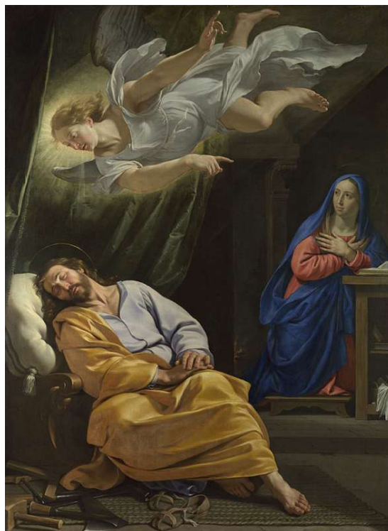
The Dream of Saint Joseph, Philippe de Champaigne (1442-1443)

In his place of emotional turmoil Joseph is visited by the angel of the Lord in his dream. The angel tells him not to abandon Mary, but to believe that she remains a virgin and that her child is conceived through the Holy Spirit. What an extraordinary step of faith, of trust, God asks of Joseph. What love Joseph must have had for God and for Mary in order to risk believing that all of this is true. This is what lies behind the rather prosaic words of Matthew: 'when Joseph woke from sleep, he did as the angel of the Lord commanded him: he took his wife.'