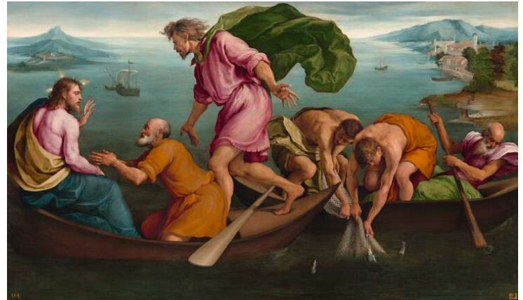
The Miraculous Draught of Fishes, Jacopo Bassano (1545)

Isaiah, St Paul, St James and St John are all overwhelmed with awe in the presence of God. We need that sense too. We need a sense of the majesty of God, of awe before the divine that is so utterly beyond us. This is part of our worship of God, above all in the Mass. We come to Mass not only to be nourished by Christ, which of course we are, but also to revere and glorify God. In this we join the seraphs in Isaiah's vision, who cry out "Holy, holy, holy is the Lord of hosts. his glory fills the whole earth."